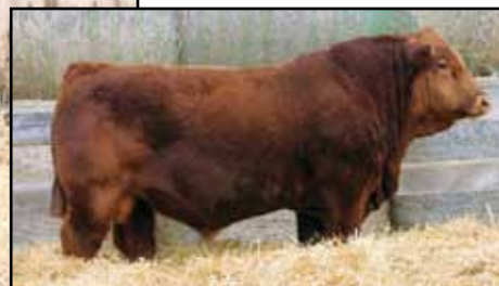
IPU Red Zone 16A

POLLED PUREBRED FEMALE PG1190348 IPU 27D 13 January 2016