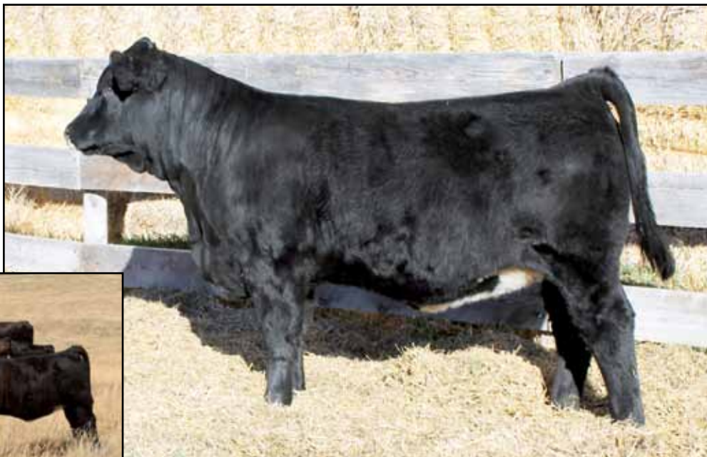
LW 7E & dam