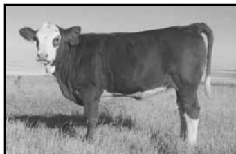
Ashworth Farm & Ranch '98