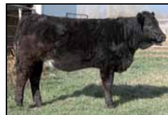
Diamond M Ranch '06