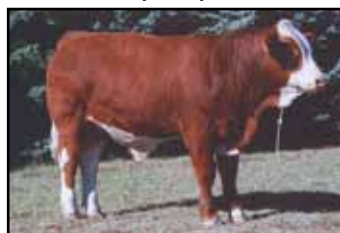
Smithbilt Simmentals '02