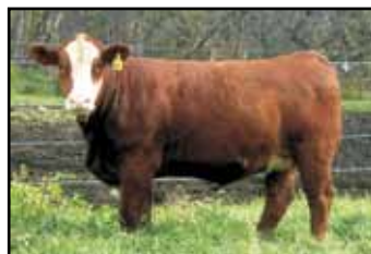
Spruce Grove Cattle Co. '05