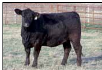
R Plus '06