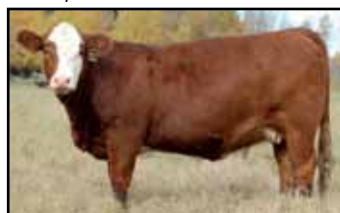
Crossroad Farms '07