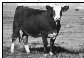
LaBatte Simmentals '00