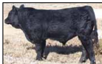
X-T Simmentals '09