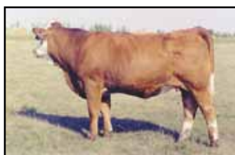
Rich Mc Simmentals '03