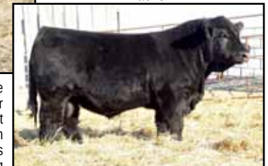
MRL Tracker 17Z

WHEATLAND PREDATOR 922W MRL TRACKER 17Z BPG773494 TSN MS EDITION 55W