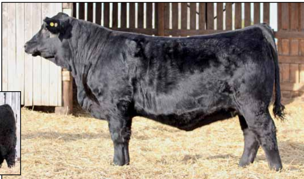
Springcreek Hercules 145C