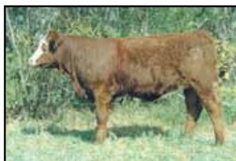
Drifting "M" Ranch '01