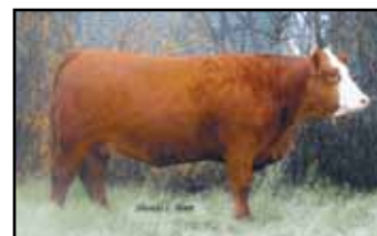
Lazy Bar B Simmentals '09