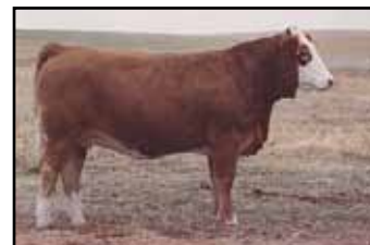
LaBatte Simmentals '04