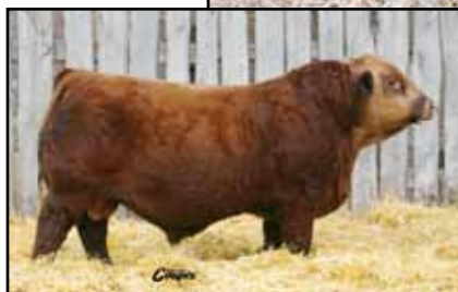
Kuntz Super Duty 4Y

NCB RED SUSPECT 30S KUNTZ SUPER DUTY 4Y PTG747559 MISS R PLUS 7037T