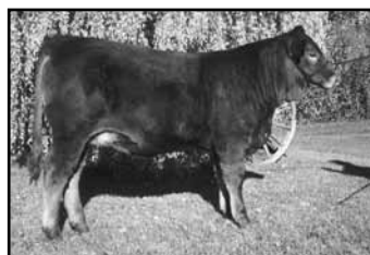
Sunny Valley '00