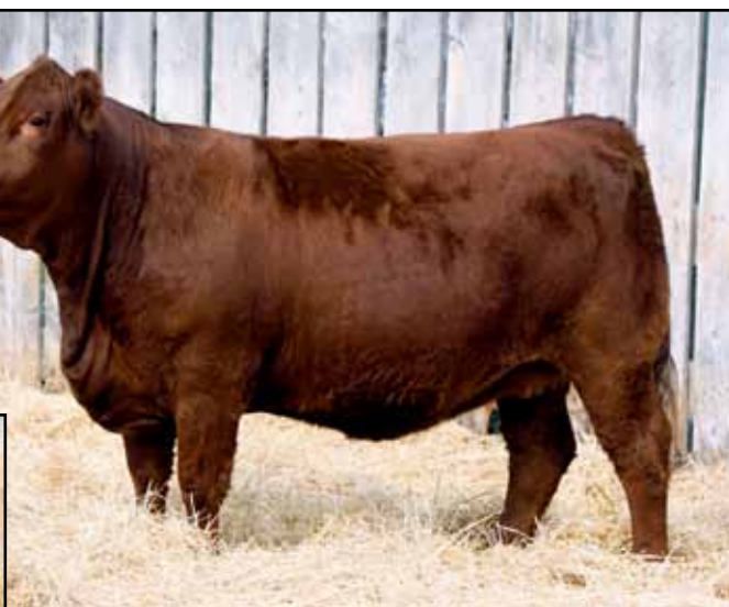
IPU Red Deputy 25C