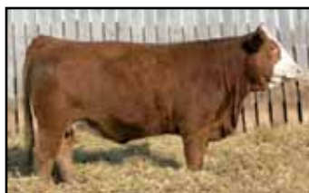
Bonchuk Farms '07