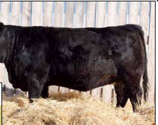
Double Bar D Tanker 191Y