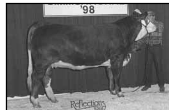
LaBatte '98 high seller