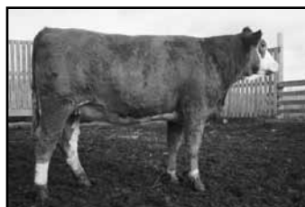
S Bar Farms '98