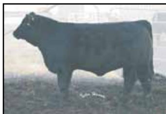
Muirhead Cattle Co. '05