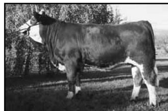
Sunny Valley Simmentals '99