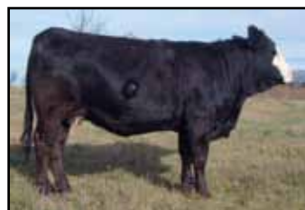
Spring Creek Simmentals '02