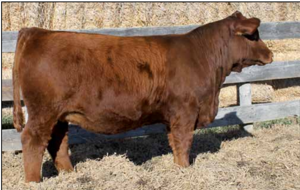
MRL Missile 138C