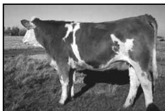
Pheasantdale Farms '97