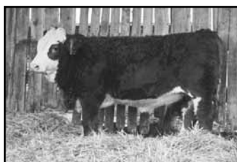
Gormlea Farms '00