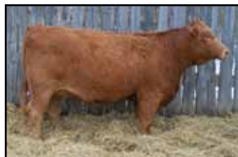
Erixon Simmentals '04