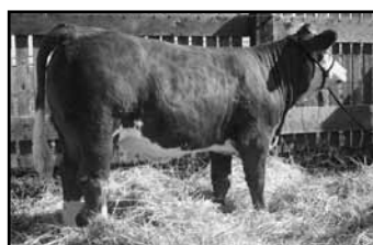
First Time Simmentals '99