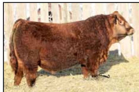
MFL Westcott 24C MRL 91Y - sire of dam