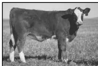
LaBatte Simmentals '97