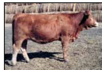
Prairie Wind Stock Farms '03