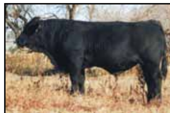
3D Simmentals '04